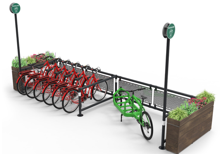
Rackless with custom front panels and end planters