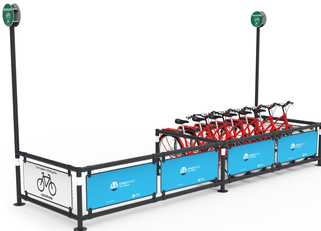
Rackless for shared bike schemes with custom front panels