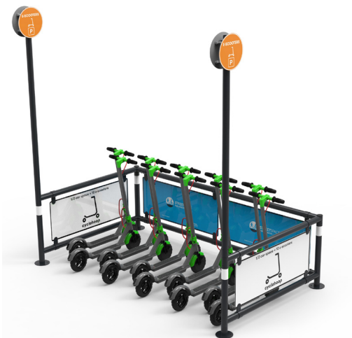
Rackless single module for shared e-scooter schemes