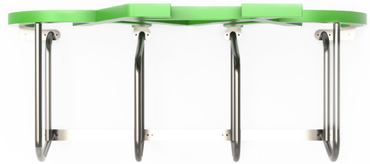
8 bikes in one parking space