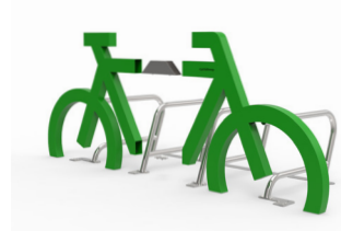
Easy to assemble