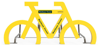
Custom branding options