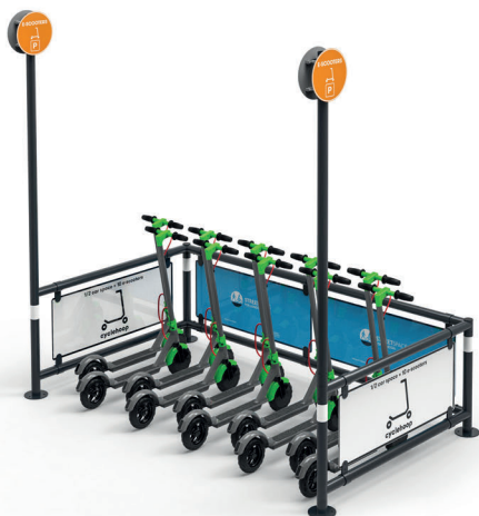
Rackless single module for e-scooter rental schemes