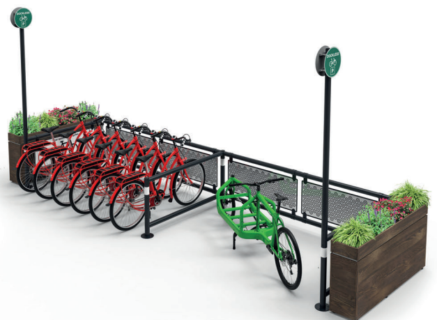
Rackless twelve space unit for mixed use